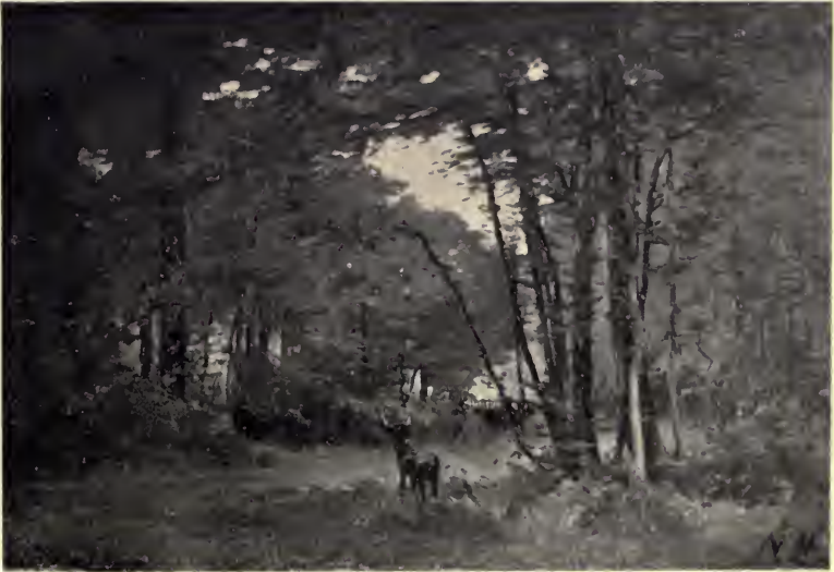
ERRIS, COUNTY MAYO By Nathaniel Hone, R. H. A.