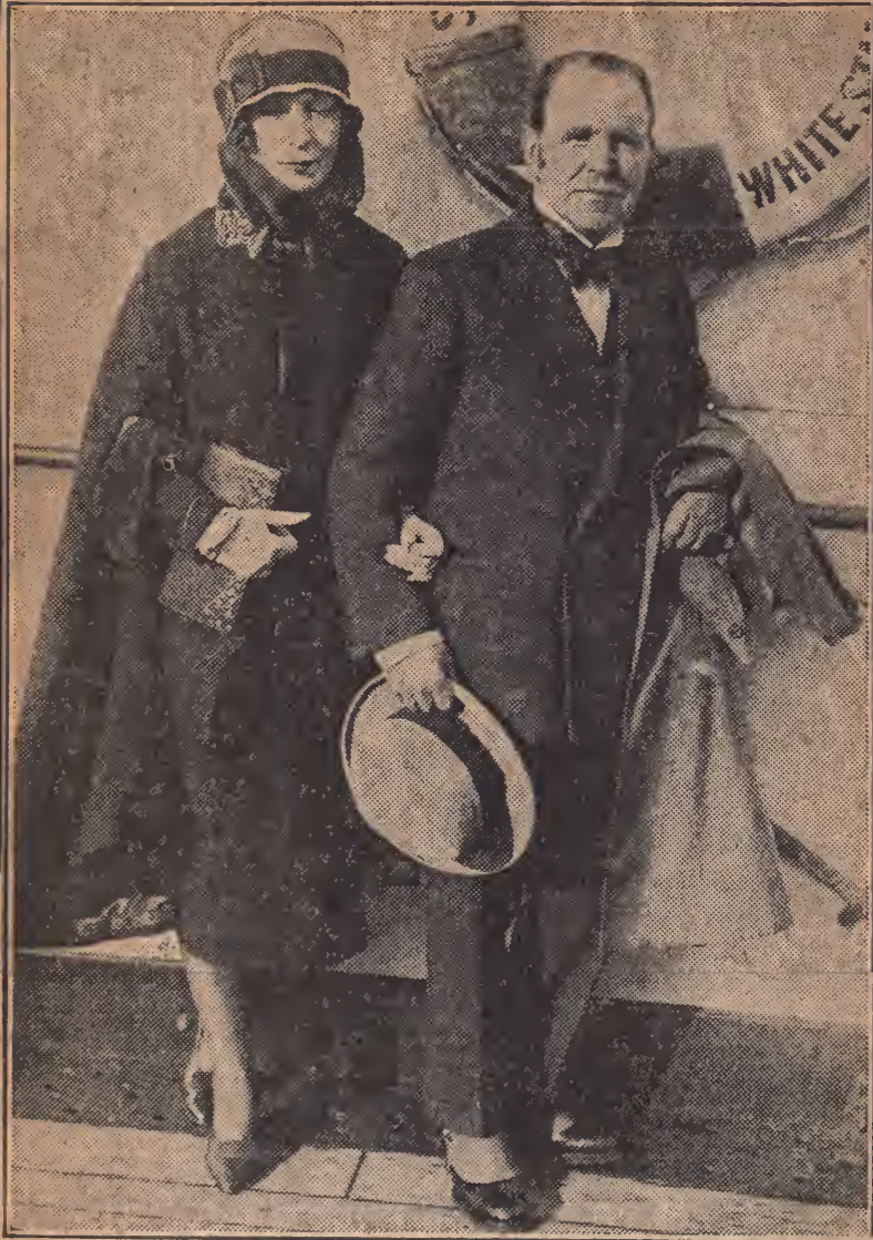
Sir John Lavery, noted painter, who drew figure which appears on Irish Free State notes, and his wife, formerly Hazel Martyn of Chicago, who was his model.