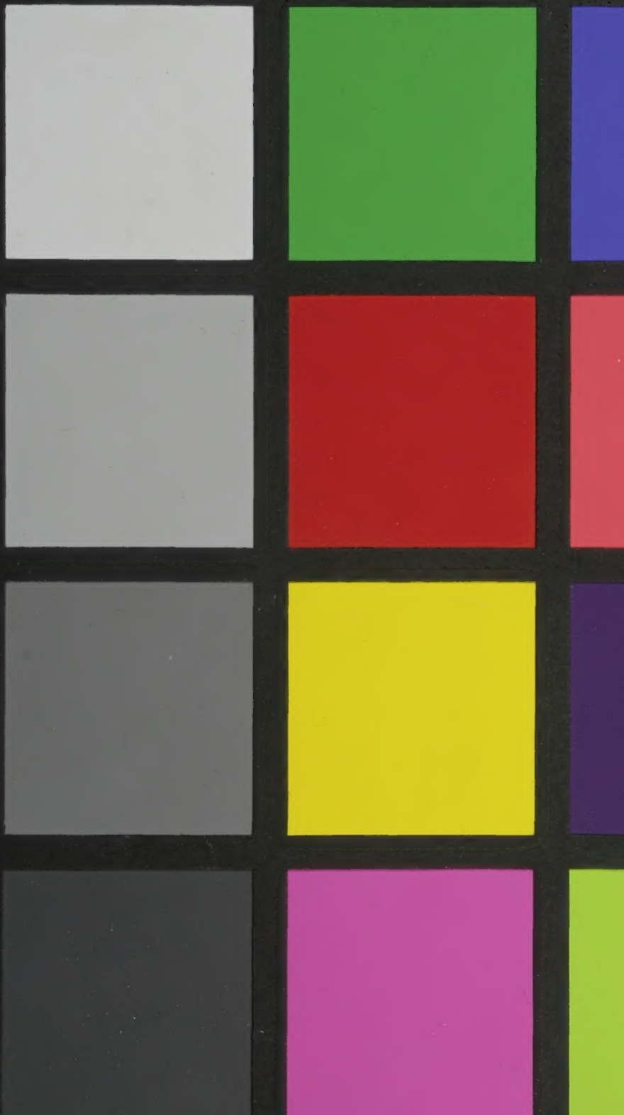
GretagMacbeth™ ColorChecker Color Rendition Chart