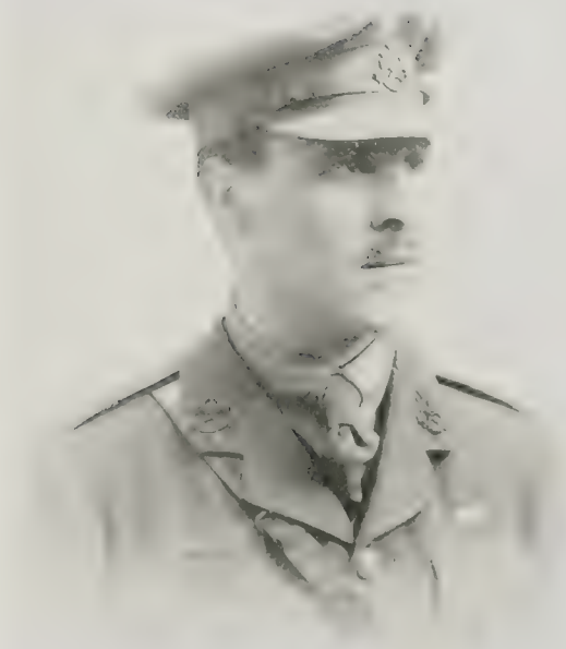
LIEUTENANT-COLONEL B. W. VANN, V.C., M.C., 1/6TH SHERWOODS. KILLED IN ACTION AT THE BATTLE OF RAMICOURT.