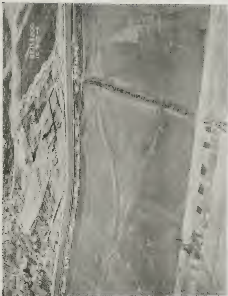
AIR PHOTOGRAPH OF BELLEGLISE AND THE ST. QUENTIN CANAL FROM ABOVE THE HINDENBURG DEFENCES WEST OF THE CANAL