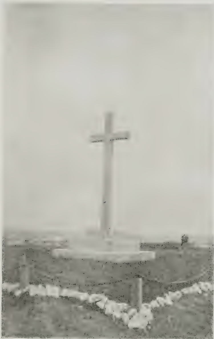
MEMORIAL CROSS ERECTED ON THE HIGH GROUND NEAR BELLENGLISE IN MEMORY OF THE FALLEN OF THE 46TH DIVISION.