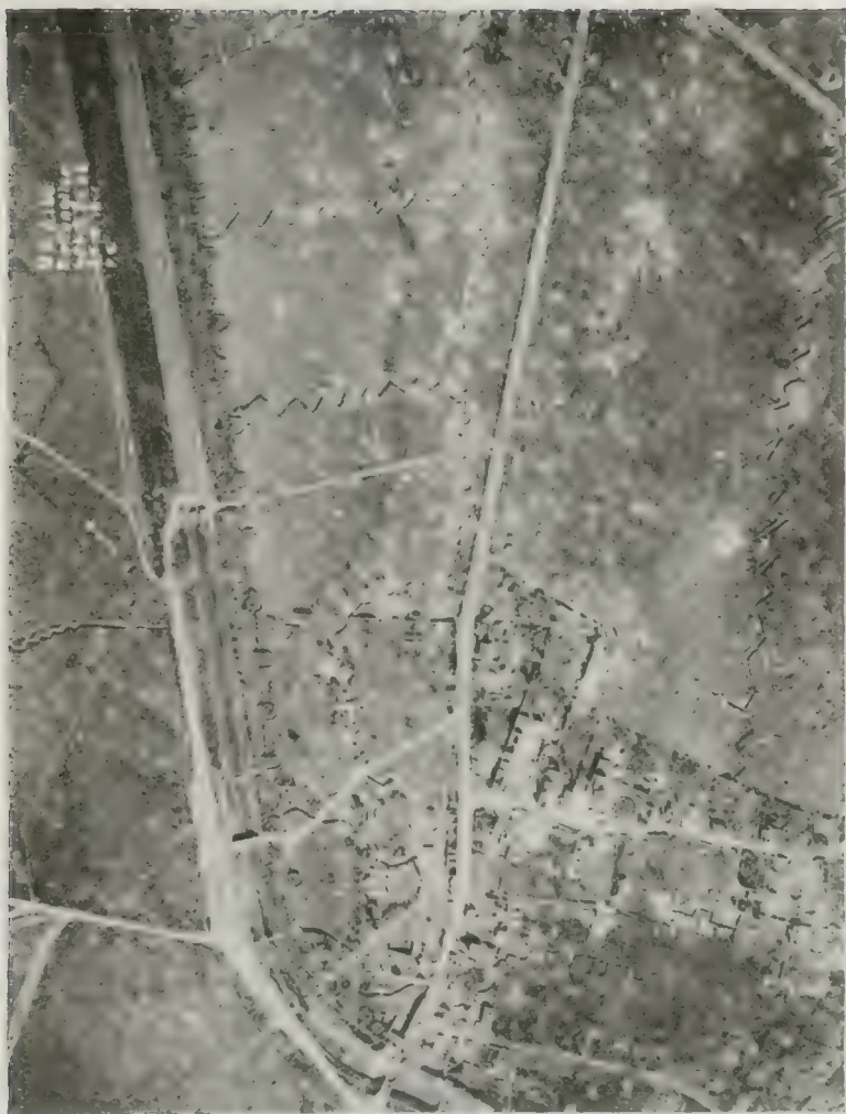
AIR PHOTOGRAPH OF THE ST. QUENTIN CANAL AT BELLEMEUSE, SHOWING THE DEFENCE SYSTEM TO THE EAST OF THE CANAL AND THE GERMAN BRIDGES.