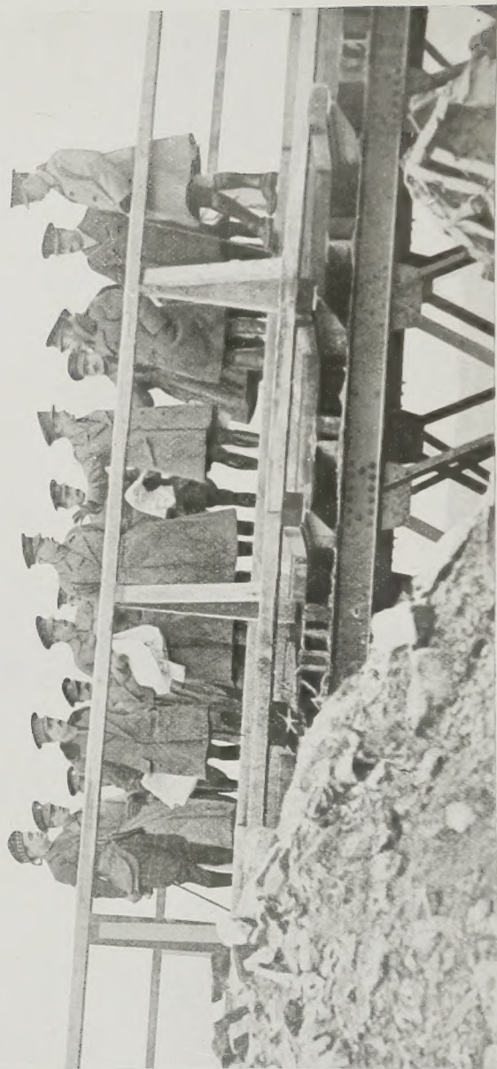
HIS MAJESTY KING GEORGE V INSPECTING THE BATTLEFIELD OF BELLENGLISE