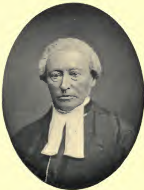
Sir Alexander Cockburn.